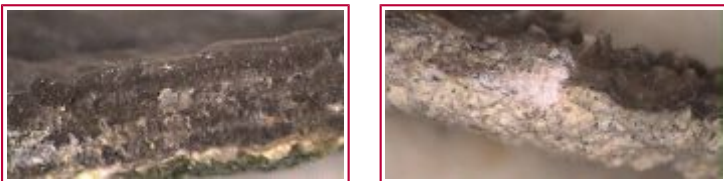
Imagen detalle / macro

(Images during the encrustation removal process).