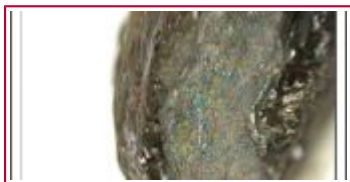
Imagen detalle / macro

Descripción: It looks at the remains of a metal ring in an old bucket tanning fully transformed chemically. Surrounded by a concrete calcium carbonate original iron metal ring that was turned into a mass of mineral sulfides, carbonates and iron oxides. Not detected remnants of the original iron alloy.