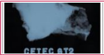
X ray radiography